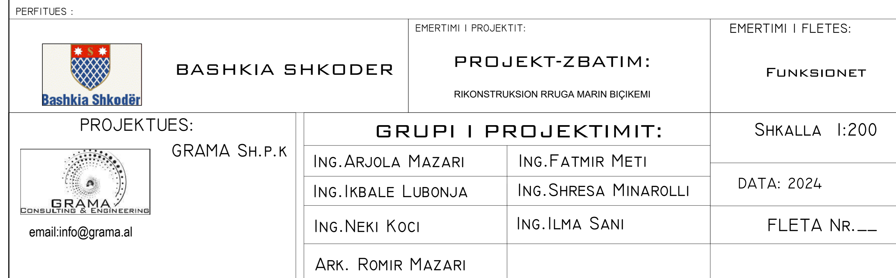
PLAN SISTEMIMI I JASHEM SH 1:200